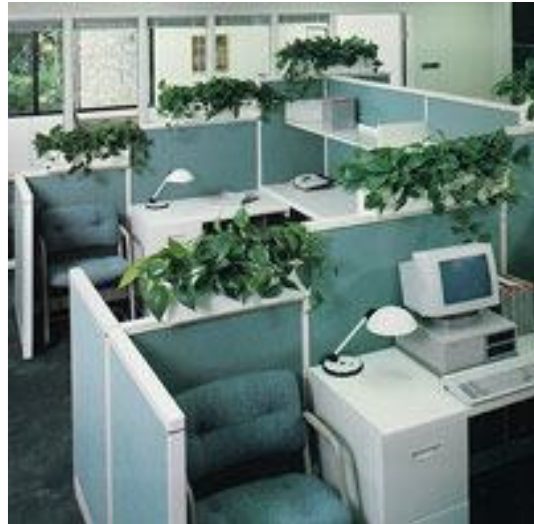
Good indoor environmental quality increases concentration and productivity